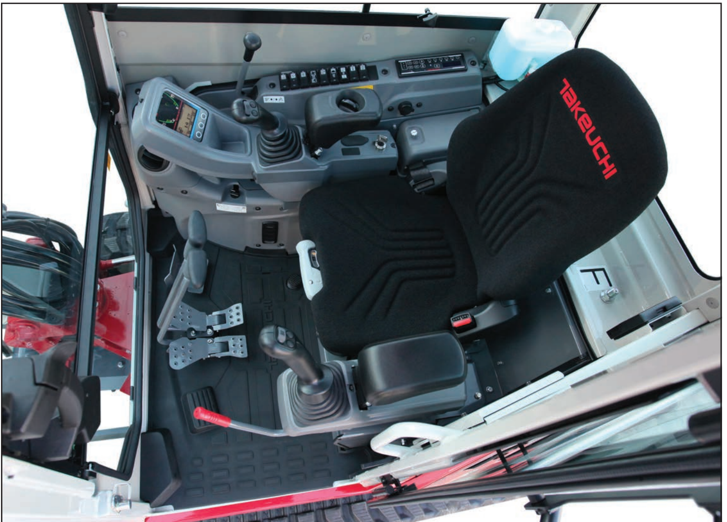
Spacious Operator's Station with Easy to Reach Controls and Switches

Standard features on the TB325R include an automatic fuel bleeding system which eliminates the need to manually prime the fuel system, automatic engine deceleration which helps conserve fuel, drain on the floor provides easier clean out and a heavy-duty wraparound counterweight which helps protect vital machine components. Additional features available on the TB325R include an LED work light package, multiple auxiliary hydraulic circuits, and an optional Takeuchi Fleet Management (TFM) telematics system.